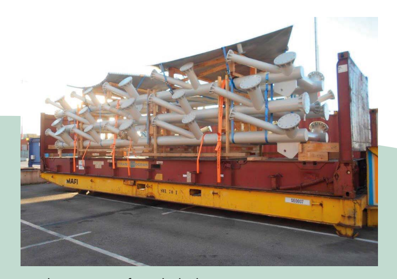
Bridge structure for Jebel Ali