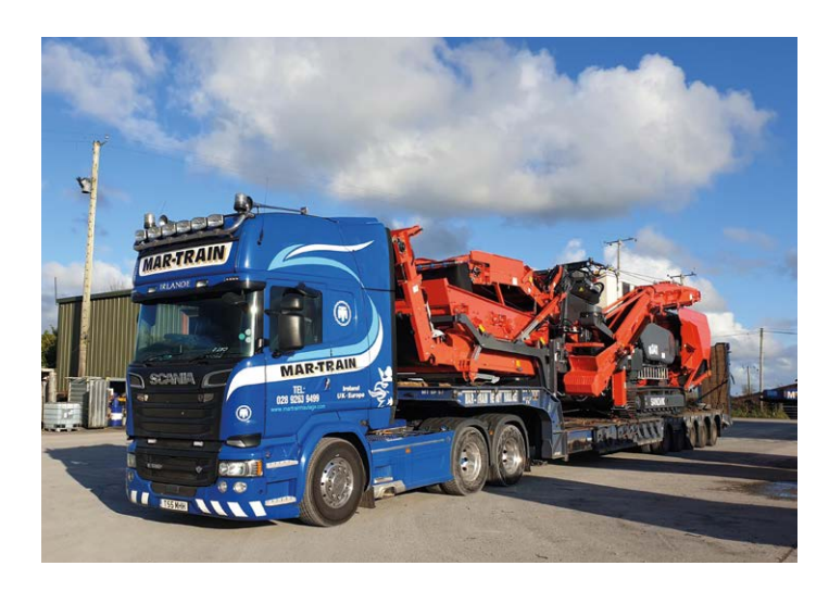
Handling machines imported from Ireland

Our teams are familiar to set up complex logistics chains and deliver high quality on oversized project cargo